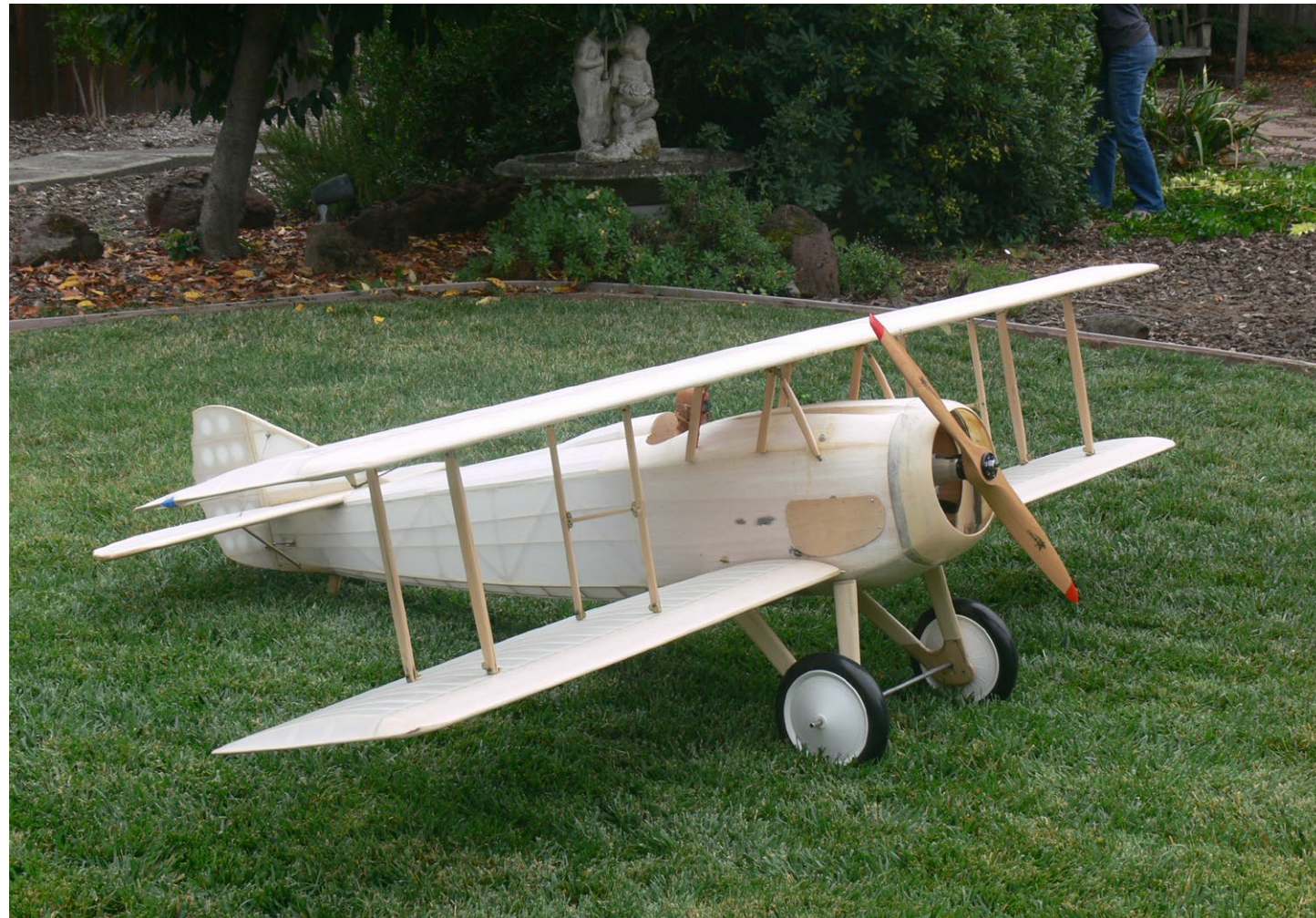
Undergoing taxi tests at WCF on 10/21/2023