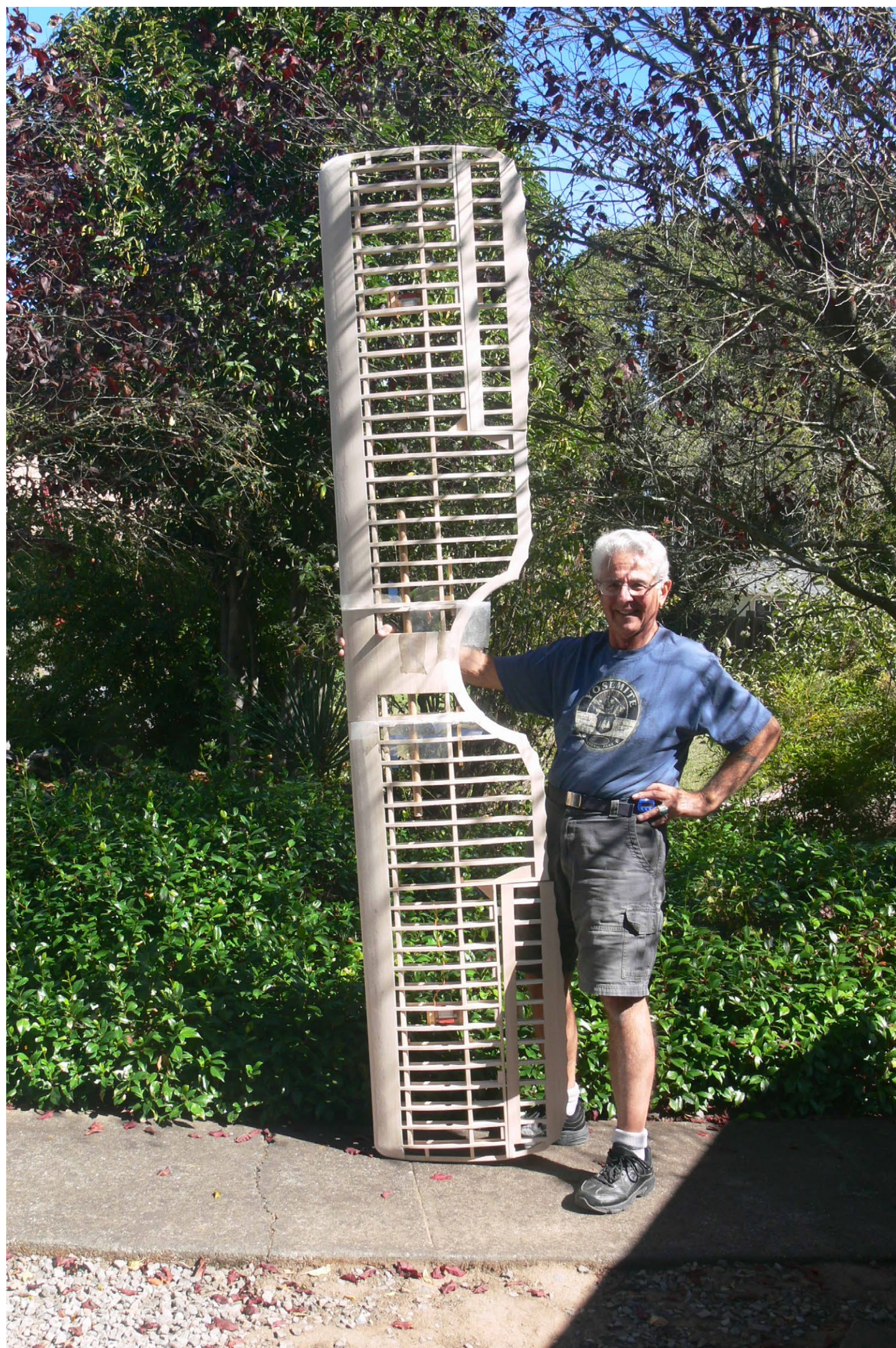
Ready for the paint job on 10/21/2023